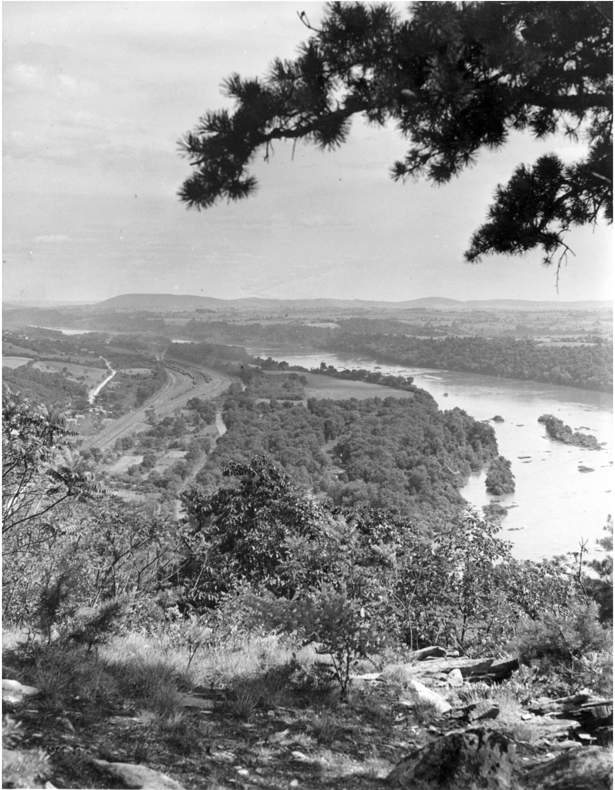
Brunswick area from Catoctin Mountain