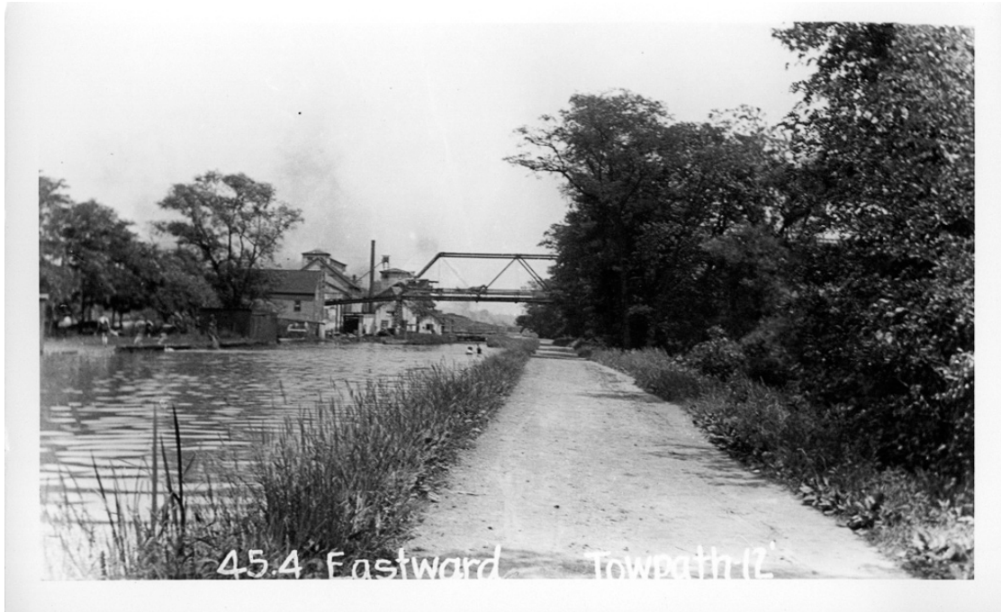
Approaching Lock 30 at Brunswick from upstream with the Potomac Bridge and mill.