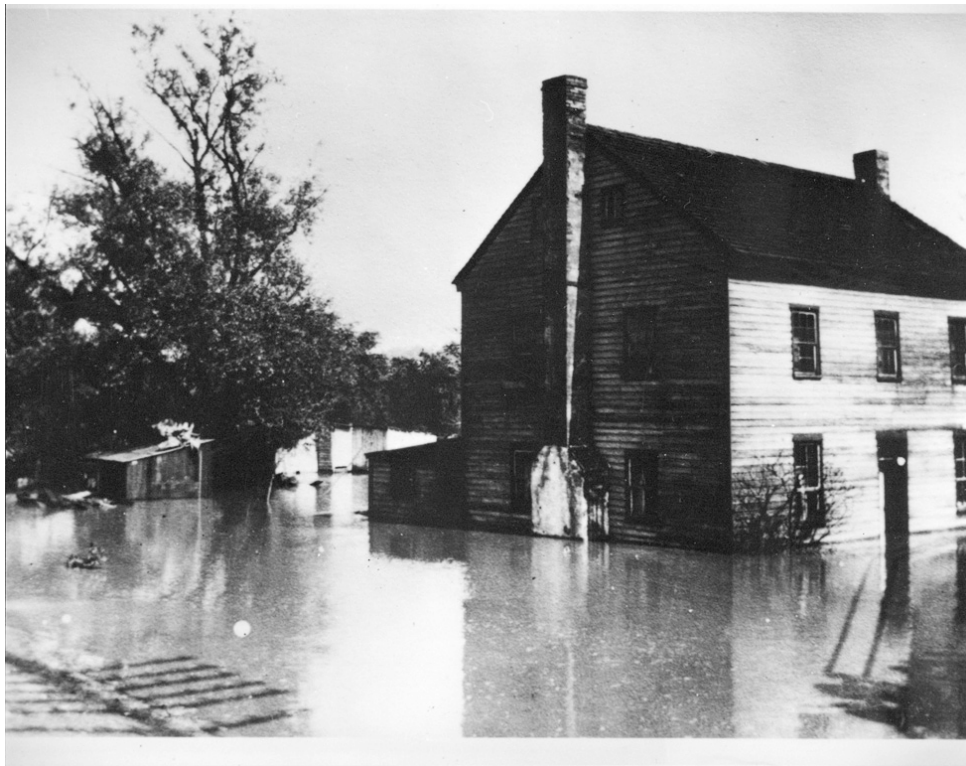
Lockhouse at Brunswick during the 1936 flood. The Lockhouse was torn down in 1954 to make way for the construction of the Highway 17 concrete bridge across the Potomac. (National Park Service, C&O Canal NHP)