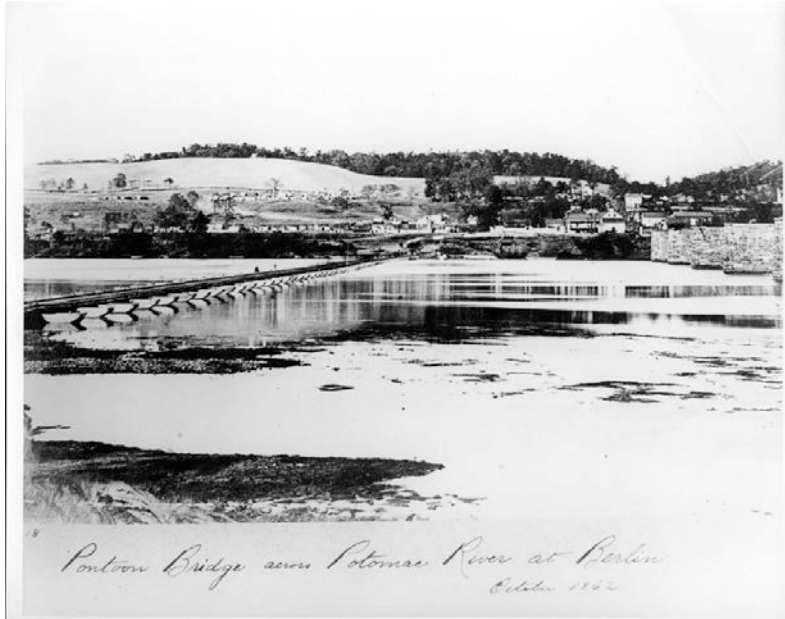
Photograph taken by Alexander Gardner in 1862 shows Berlin (with pontoon bridge) from the Virginia side of the Potomac. From Alexander Gardner's Sketchbook , War Department General Staff Files, Record Group 165-SB, National Archives