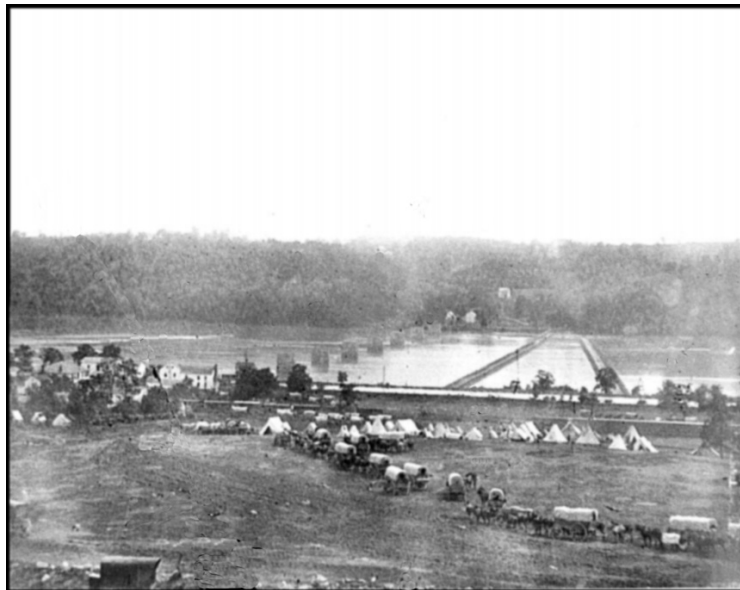
Union forces near Berlin with pontoon bridges in the background. September/October, 1862.