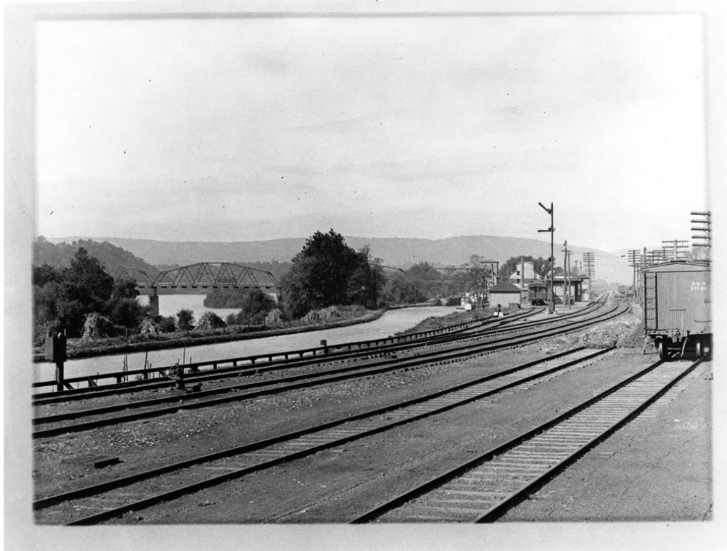
Canal with Lock 30, the mill, and the Potomac bridge in the background; and the B&O mainline and sidings in the foreground.