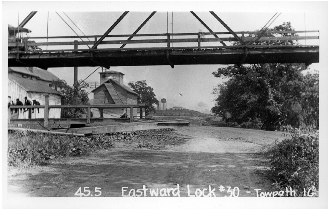
Bridge over the canal, towpath, and Potomac at Brunswick with the mill in the background and lock on the left.