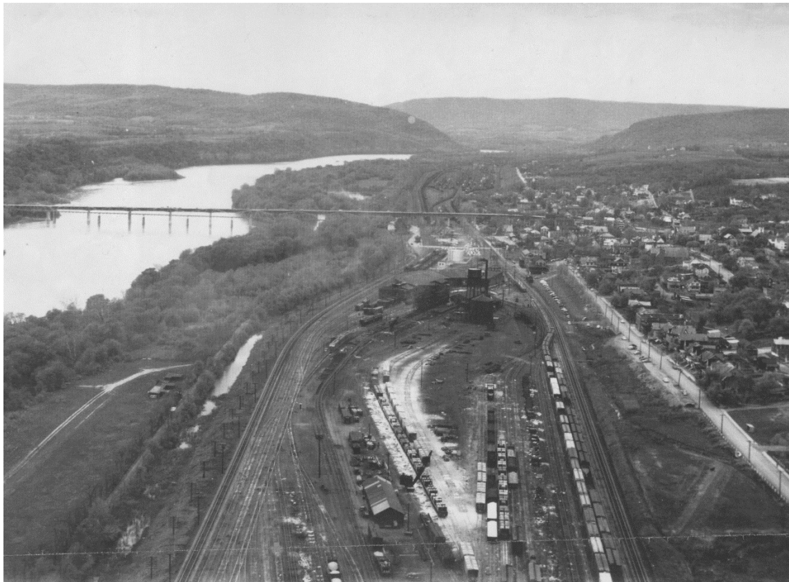
Aerial view of Brunswick, 1955.