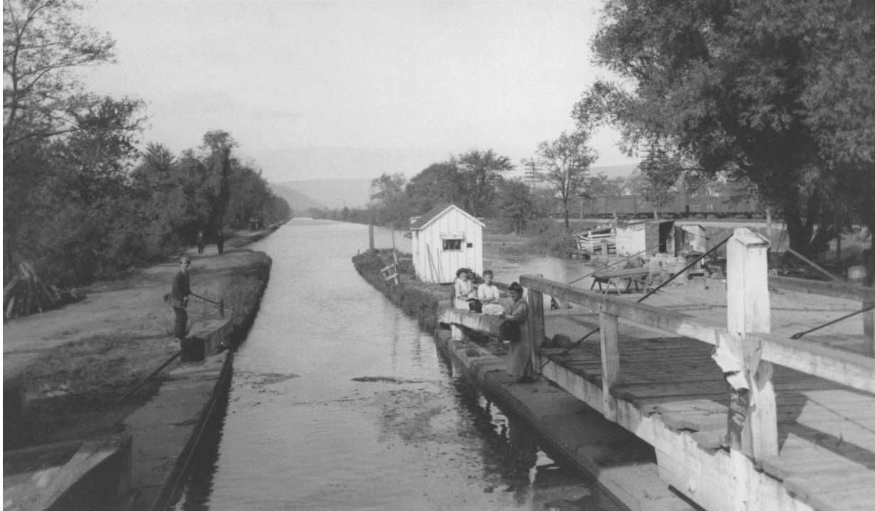
Brunswick Lock 30 looking upstream.