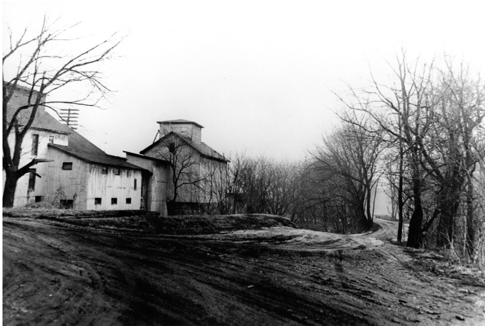
Jordan and Crampton Mill looking downstream in 1964.